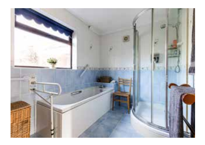
...offering a peaceful retreat with versatile living spaces.