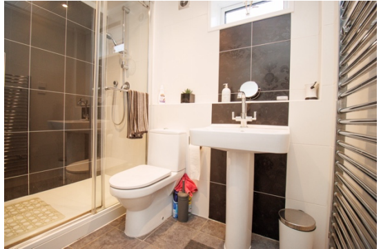
BATHROOM 1.78m x 2.34m (5'10" x 7'8")

Large walk-in shower with mixer taps. Handbasin and wc. Tiled walls and floor. Extractor fan. Chrome ladder radiator. Small upvc double glazed window.