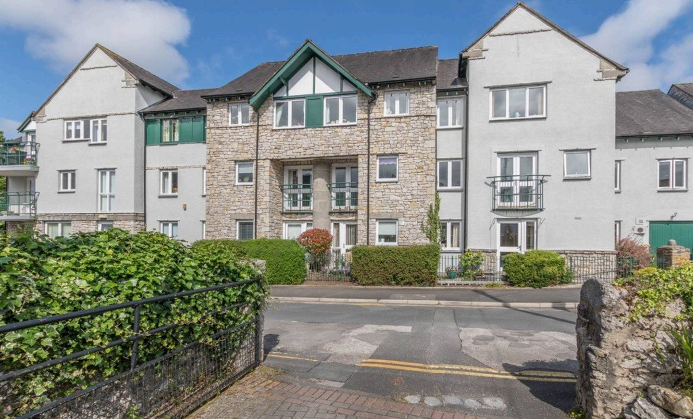
Flat 24, Hampsfell Grange Hampsfell Road, Grange-Over-Sands £145,000