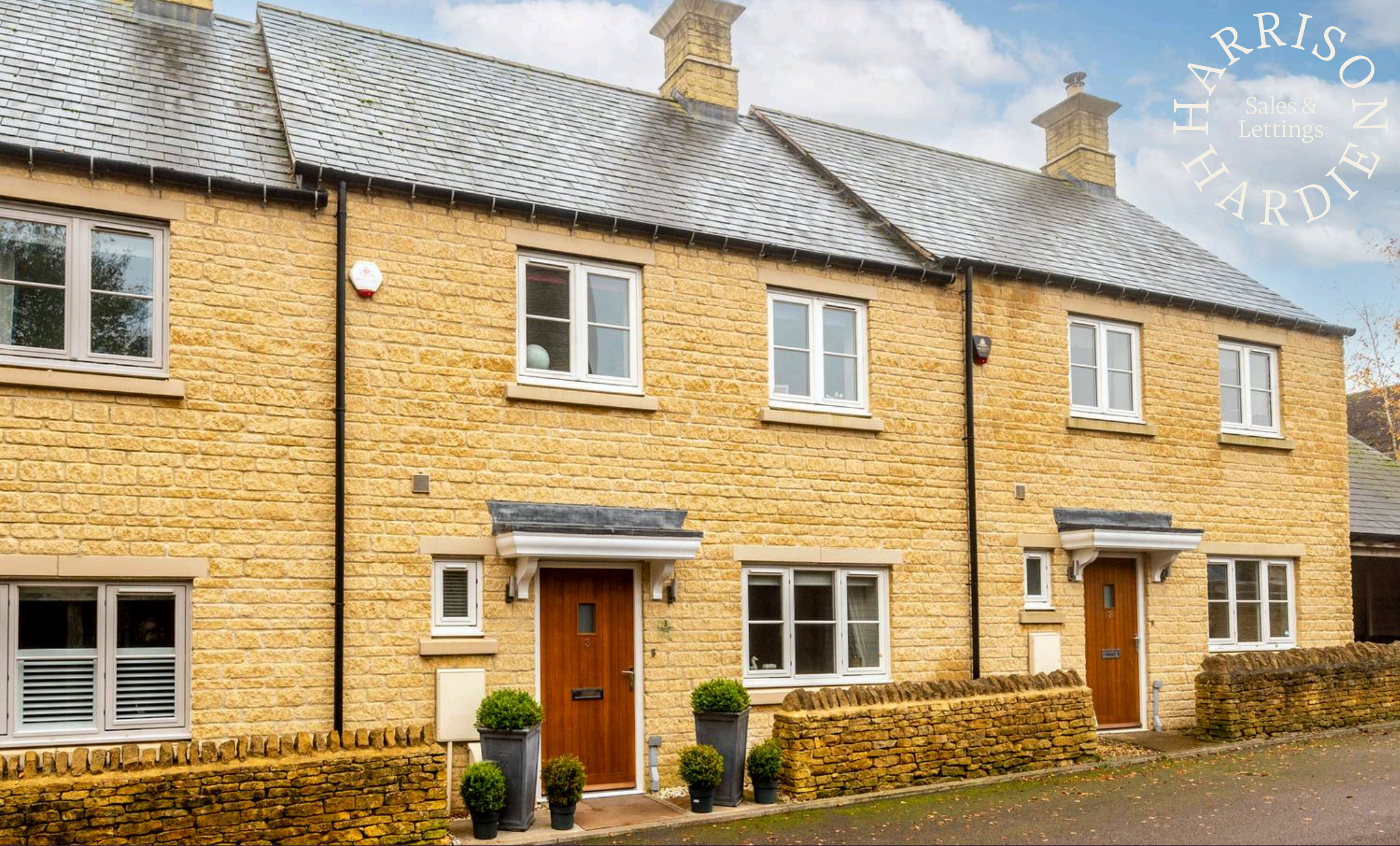
Eastview Close, Stow On The Wold