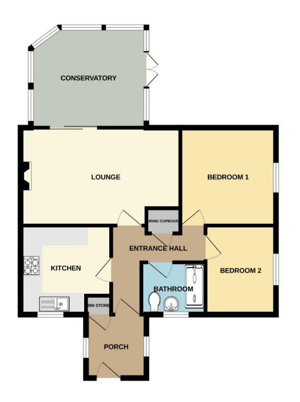
GROUND FLOOR 681 sq.ft. (63.3 sq.m.) approx.

A luxury shower room having a fitted 1700mm shower tray with a glass screen and a thermostatic bar shower over, a vanity unit houses the wash basin and there is a close coupled toilet. Double glazed window.