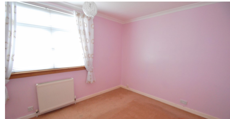
30 Graham Crescent