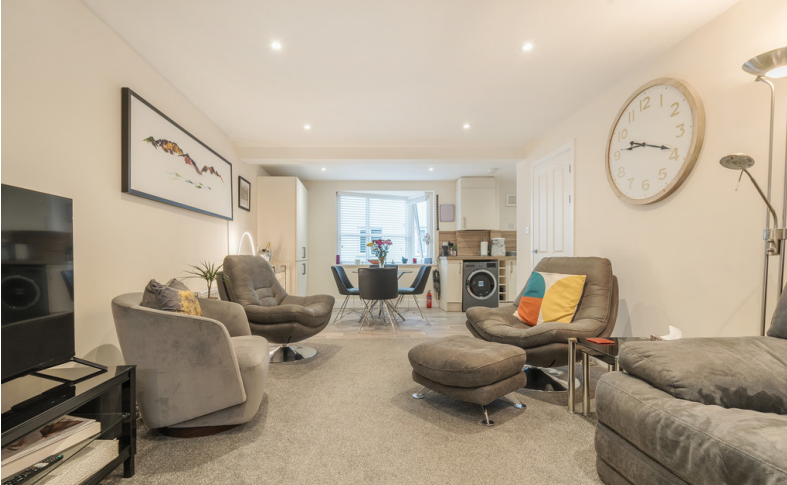
Living Room/Dining Area