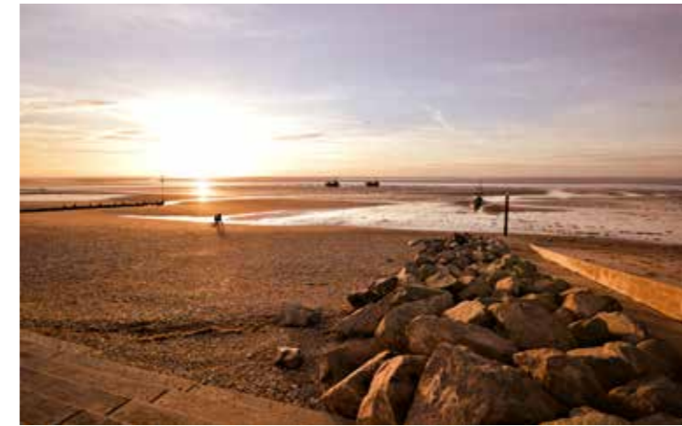
Sunset on Hunstanton beach.

“This home invites you to create your own memories and enjoy all the charm of seaside living.”