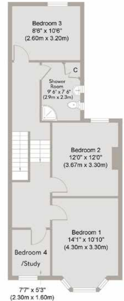
First Floor Approximate Floor Area 659 sq. ft (61.23 sq. m)

Whilst every attempt has been made to ensure the accuracy of the floor plan contained here, measurements of doors, windows, rooms and any other items are approximate and no responsibility is taken for any error, omission, or mis-statement. This plan is for illustrative purposes only and should be used as such by any prospective purchaser or tenant. The services, systems and appliances shown have not been tested and no guarantee as to their operability or efficiency can be given.