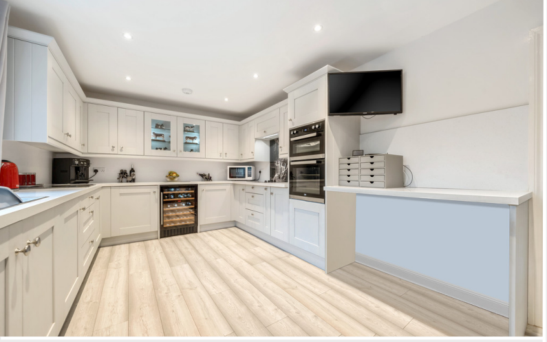
Kitchen/ Dining Room