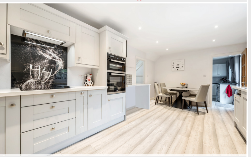
Kitchen/ Dining Room