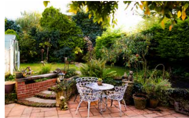
Meadow View patio.

“Our favourite spot in the house is the patio - it's a real suntrap and a great space to relax.”