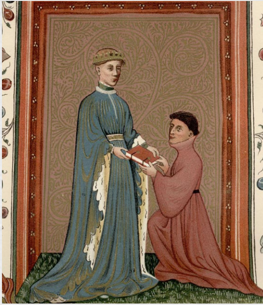
Prince of Wales Henry V, presenting Thomas Hoccleve's, Regement of Princes to John de Mowbray