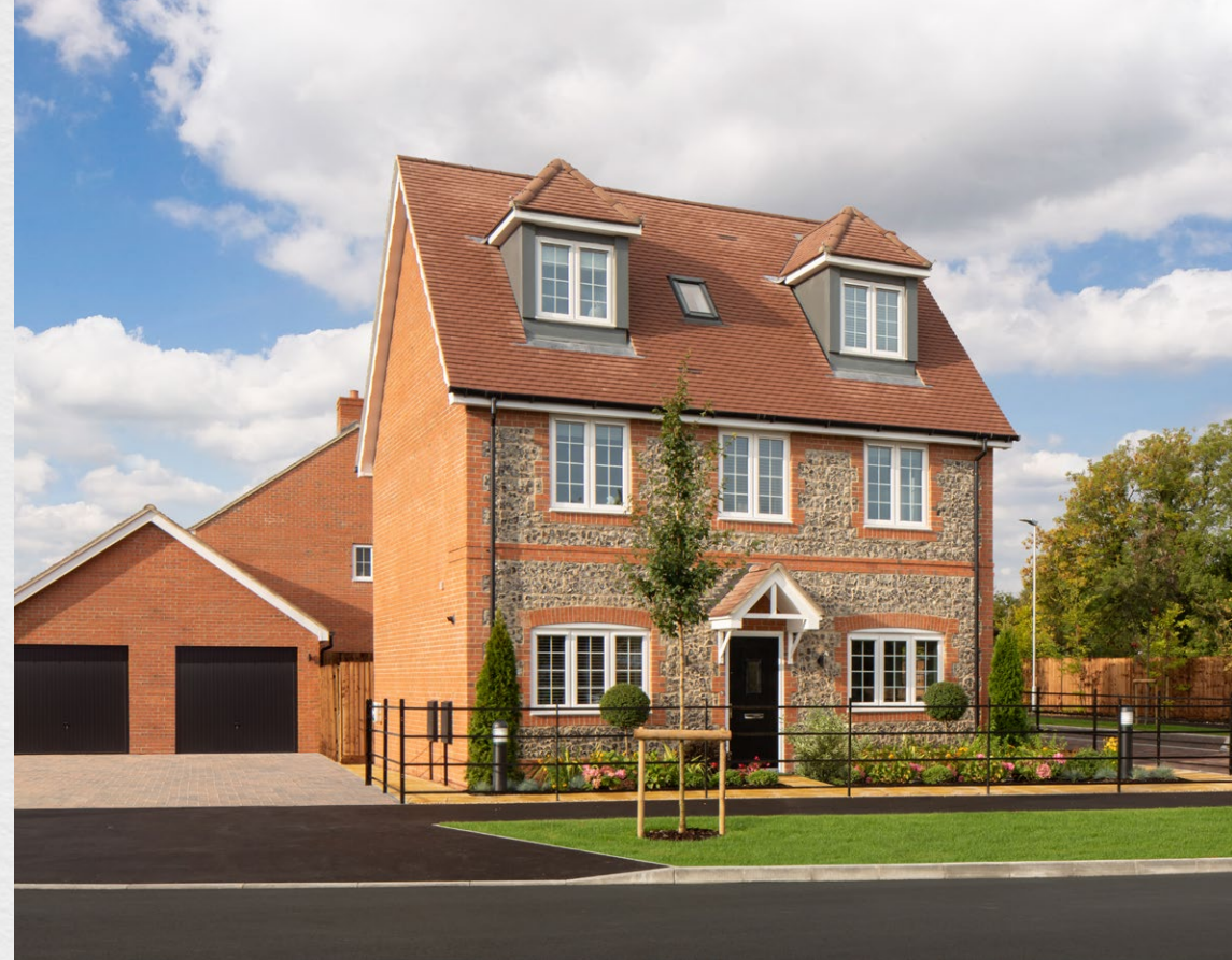
Photography from previous developments

We are a leading UK house builder. With a commitment to tackling the housing crisis head on, we operate in all major sectors across affordability and life stage in order to meet the UK's long term social and economic need for quality housing for all demographics. Backed by our long-term investment strategies, we are leveraging both traditional and modular construction in order to revolutionise and speed up delivery, building houses to sell and rent, creating vibrant retirement communities and seeking new ways to deliver affordable housing. With a pressing need to ensure that the homes we build are also future-proofed and sustainable, we have committed that all our new homes will be operationally carbon emission-free from 2030.