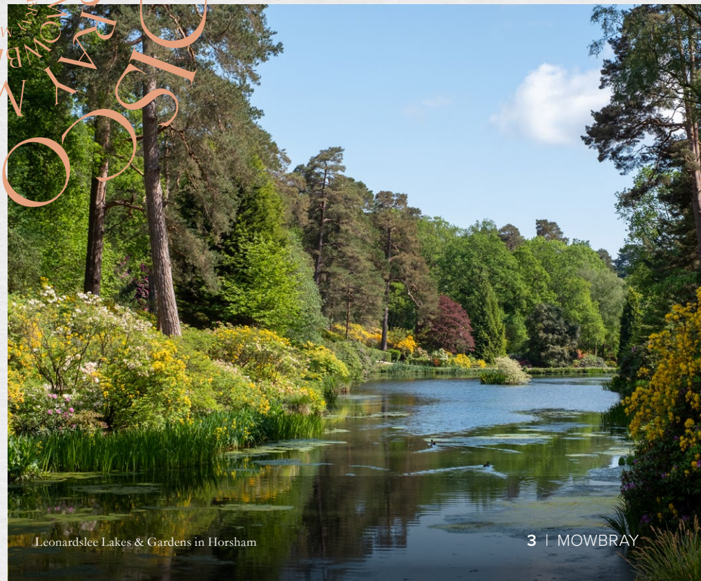
Leonardslee Lakes & Gardens in Horsham