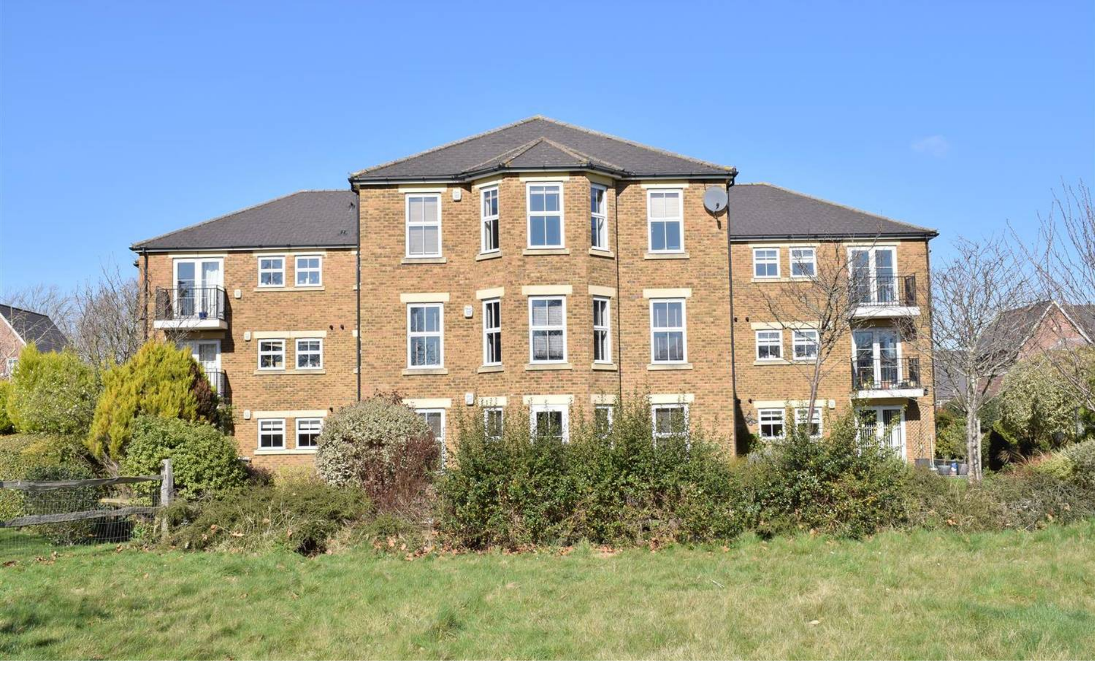
Silk Croft, Horton Crescent, Epsom