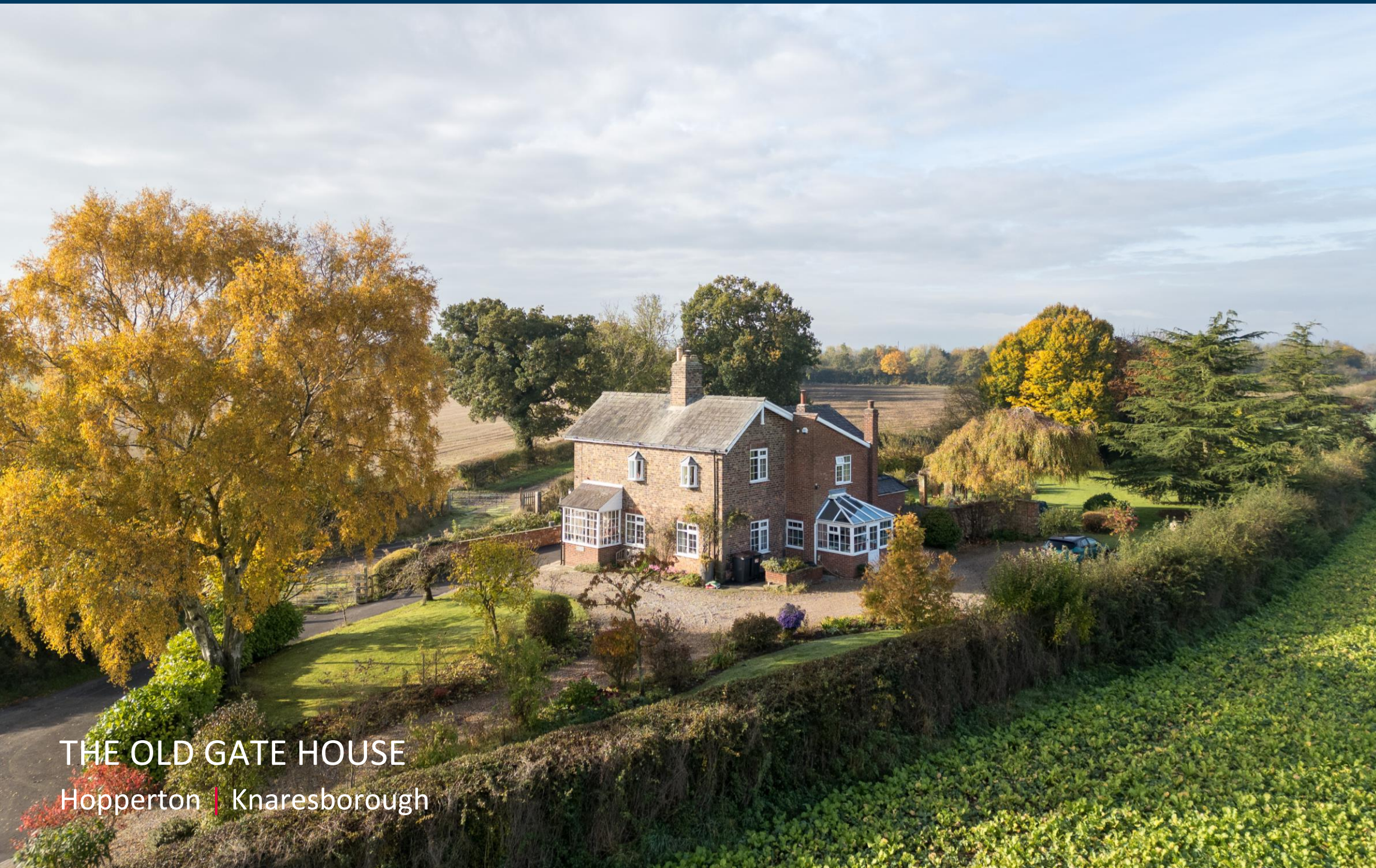
THE OLD GATE HOUSE Hopperton | Knaresborough