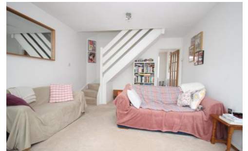
Frankland Close Bath, BA1 4EL