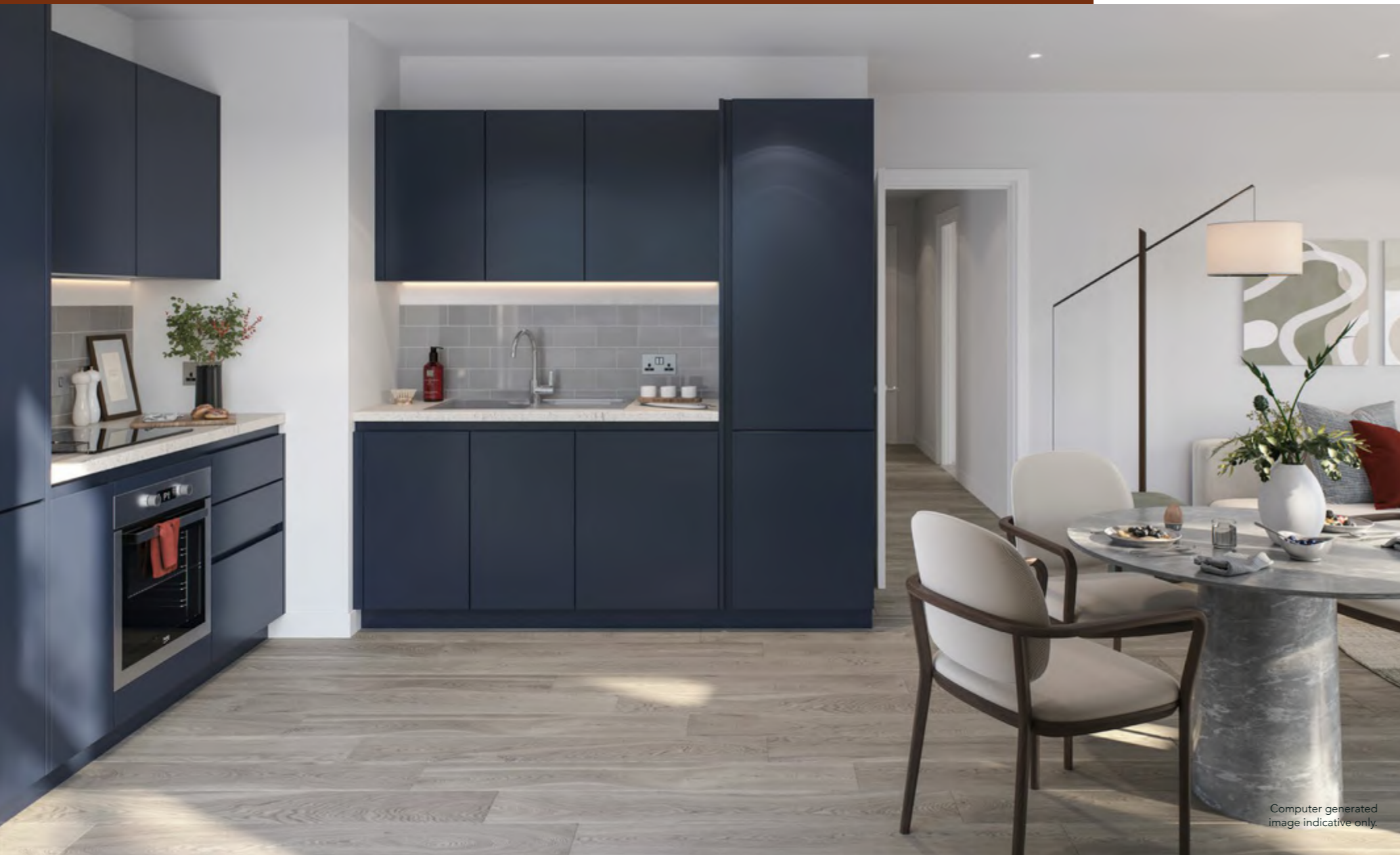
Computer generated image indicative only.