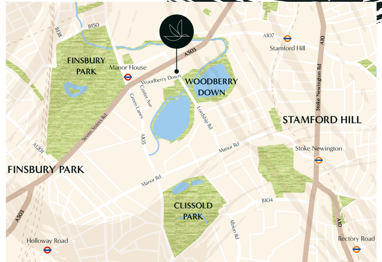
Map not to scale.