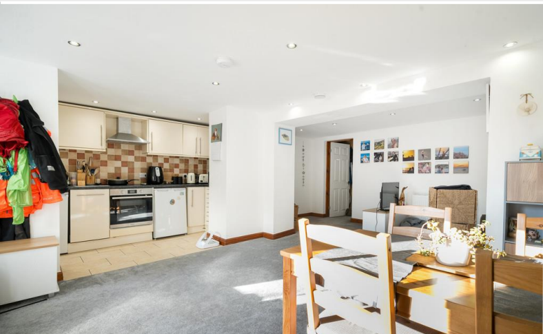
Living Room/Dining Room/Kitchen