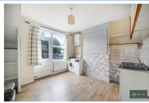
Grange Road, London NW10 £840,000 Freehold

Welcome to Grange Road, an attractive freehold, chain-free property that offers versatility and potential. Set up as two separate flats, this 1,329 sq ft home requires modernisation, providing a unique opportunity to tailor it to your preferences. The first floor comprises two bedrooms, a spacious reception room with bay windows, a bathroom, and a kitchen diner with garden access. The ground floor mirrors this layout, enhancing the flexibility for dual-family living or integration into a four-bedroom residence. Situated in NW10, Grange Road is well-connected. Residents benefit from proximity to Willesden Green and Dollis Hill stations (Jubilee Line), and Kensal Rise (Over ground), along with several bus routes, ensuring easy access to central London and beyond. The area also boasts nearby green spaces such as Roundwood Park and is within reach of the amenities in Willesden Green and Kensal Rise