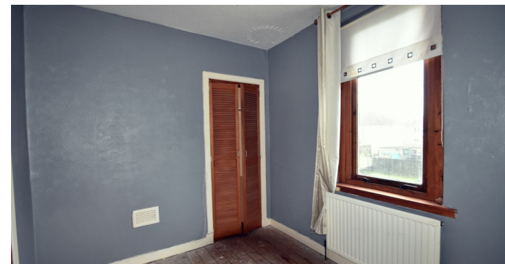
17 Allanbank Street