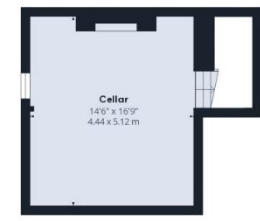
Floor -1 Building 1