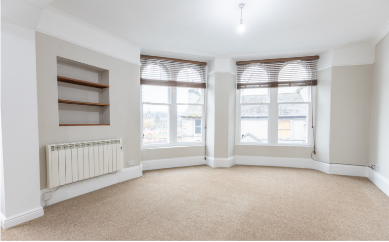
Open Plan Living Room & Kitchen