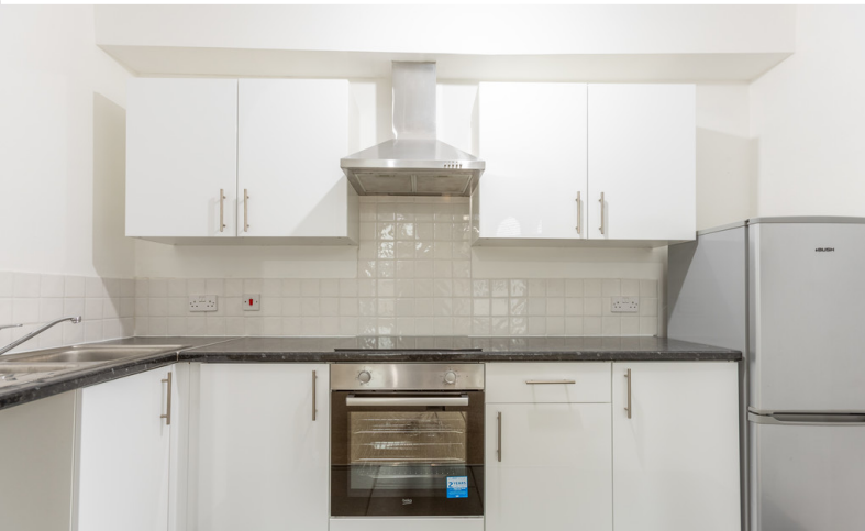
Open Plan Living Room & Kitchen