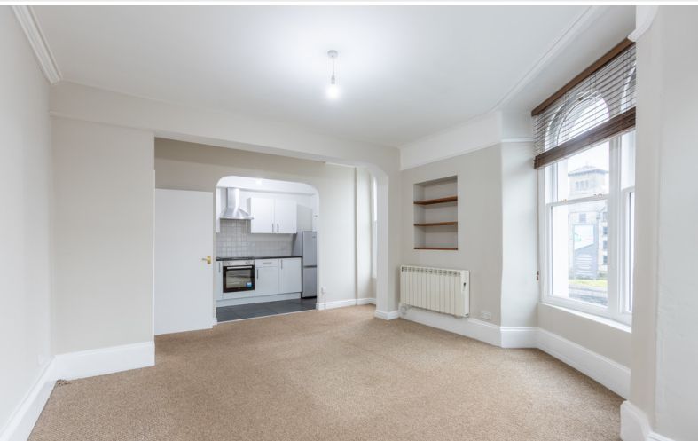
Open Plan Living Room & Kitchen