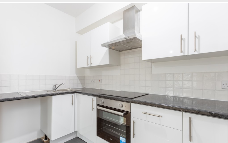
Open Plan Living Room & Kitchen