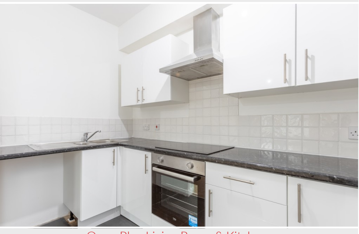
Open Plan Living Room & Kitchen