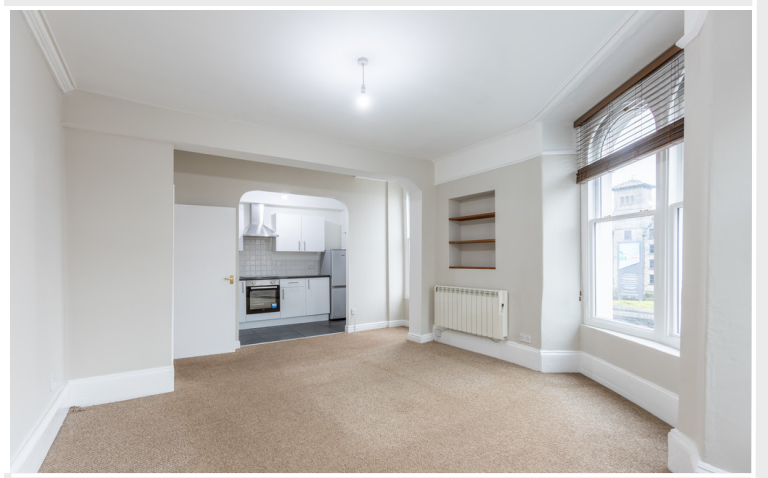
Open Plan Living Room & Kitchen