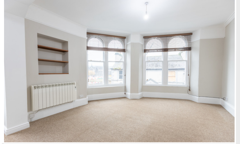
Open Plan Living Room & Kitchen