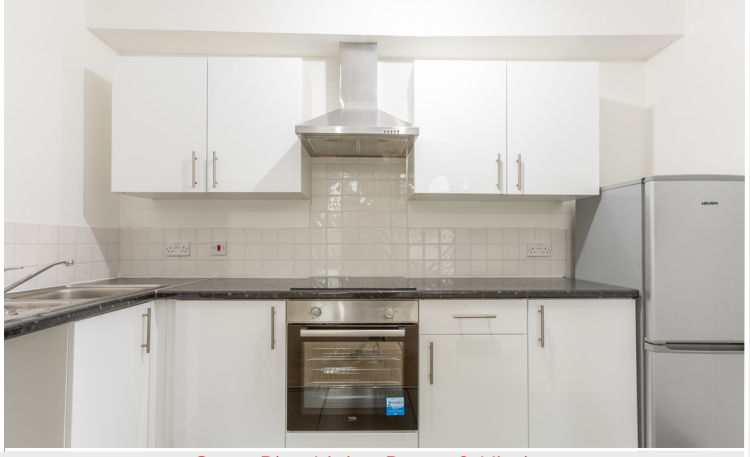
Open Plan Living Room & Kitchen