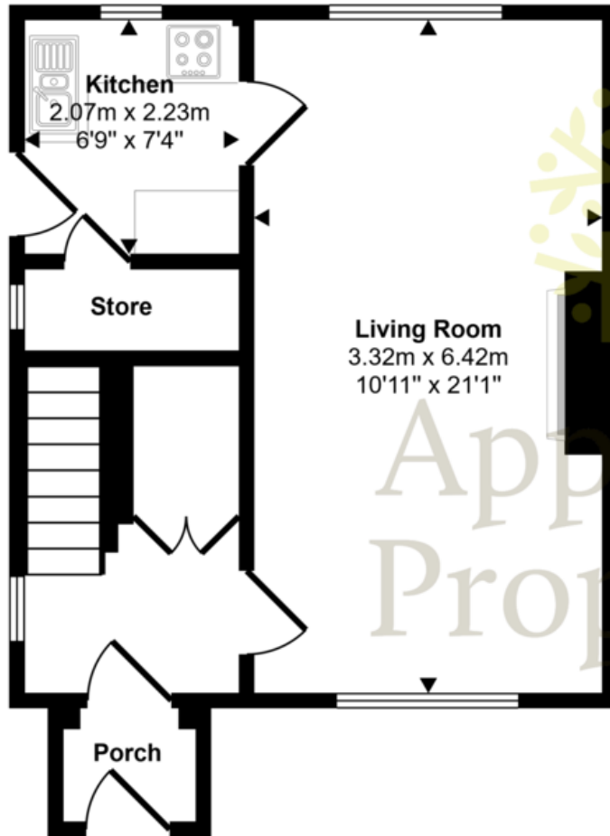
Ground Floor Approx 37 sq m / 398 sq ft

Approx Gross Internal Area 73 sq m / 784 sq ft