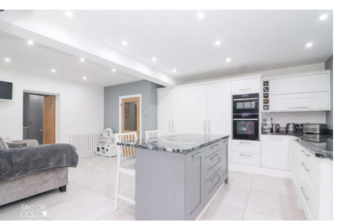
Orton Avenue £489,000