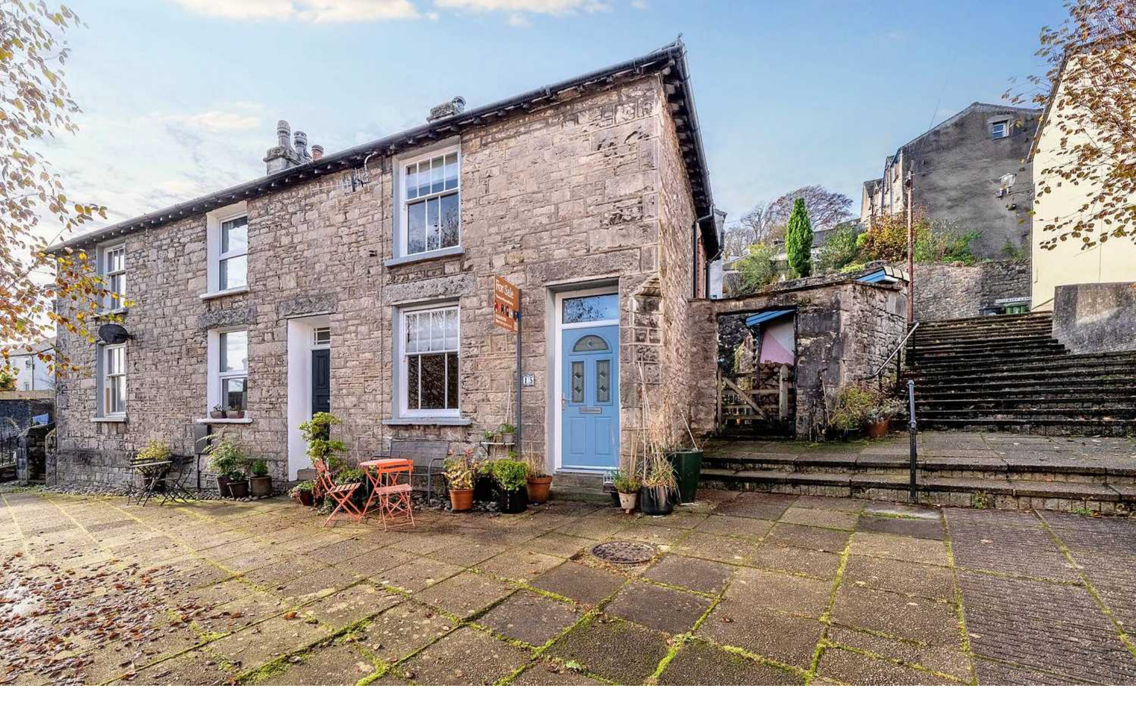
15 Middle Lane, Kendal £240,000