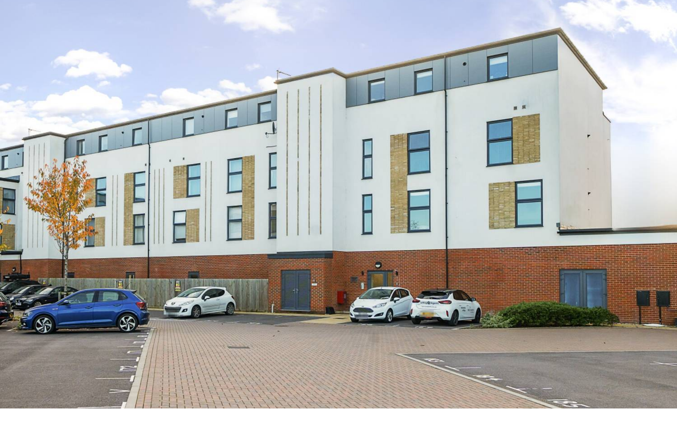
Flat 21 Longacre House, Longacres Way, Chichester, PO20 2JG Offers in Region of £250,000