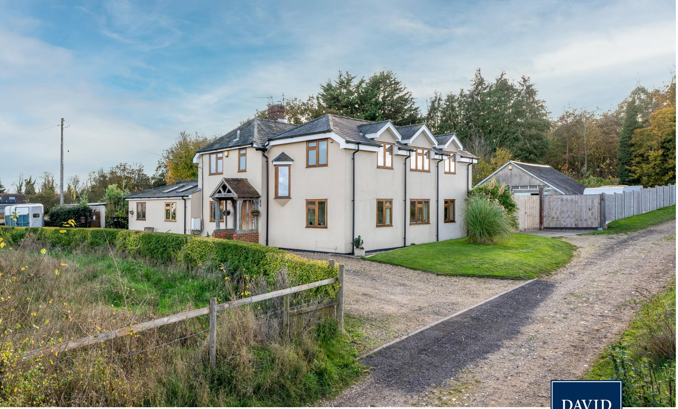
Pitt House New England, Essex