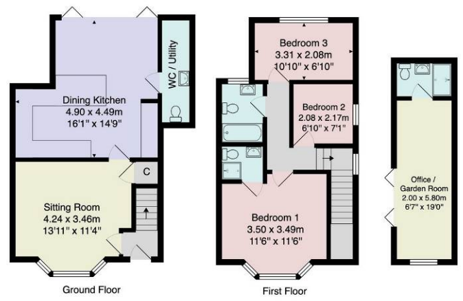
Total Area: 86.2 m² ... 928 ft² (excluding office / garden room) All measurements are approximate and for display purposes only. No liability is accepted by either the agency or Box Property Solutions Ltd as to the exact measurements of the rooms. Box Property Solutions Ltd retains the copyright on this plan and allows agents to use it with agreed permission.