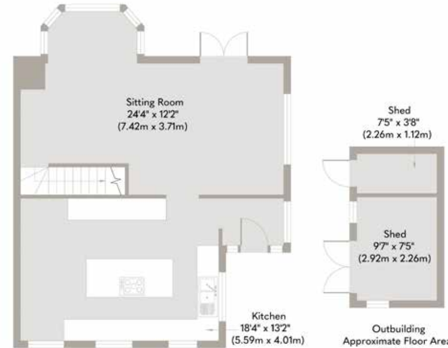
Ground Floor Approximate Floor Area 609 sq. ft (56.57 sq. m)