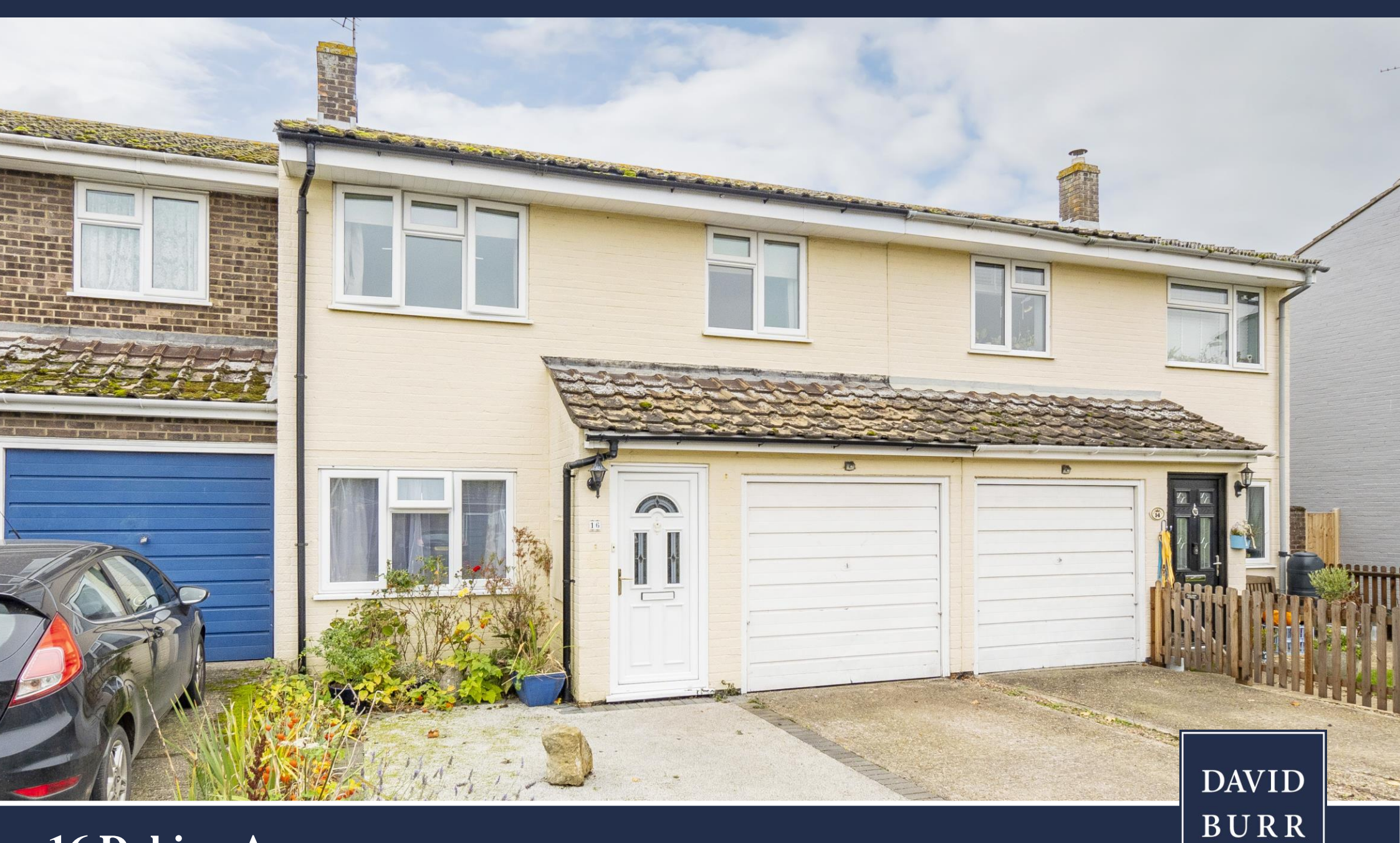
16 Daking Avenue, Boxford, Sudbury, Suffolk, CO10 5QA