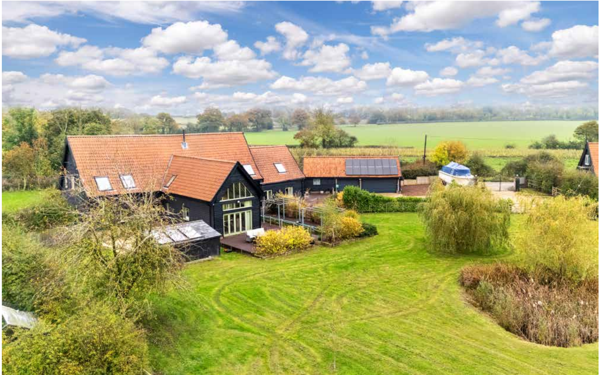
Black Barn Gissing | Diss | Norfolk | IP22 5UT