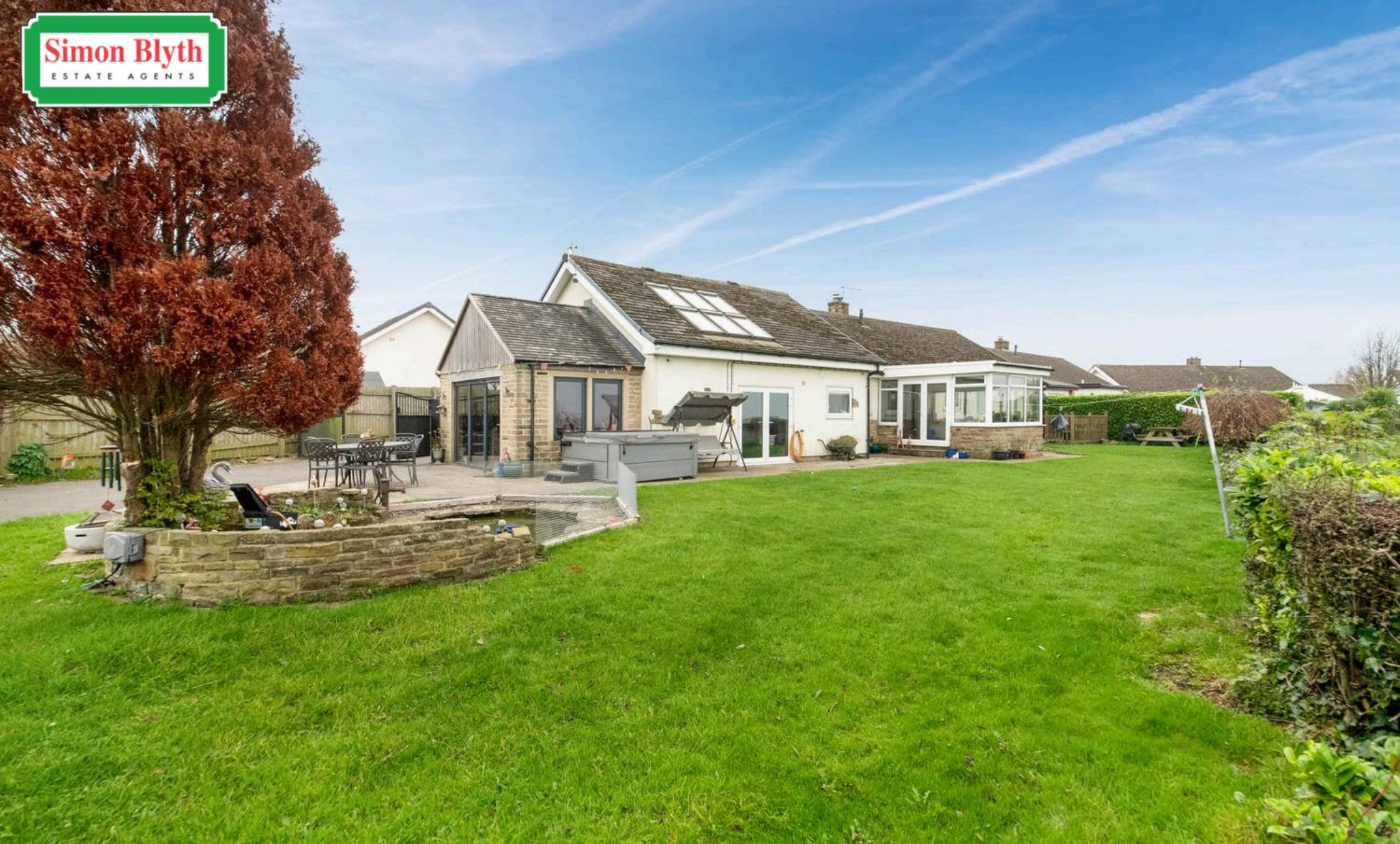
South Croft, Upper Denby Huddersfield, HD8 8UA