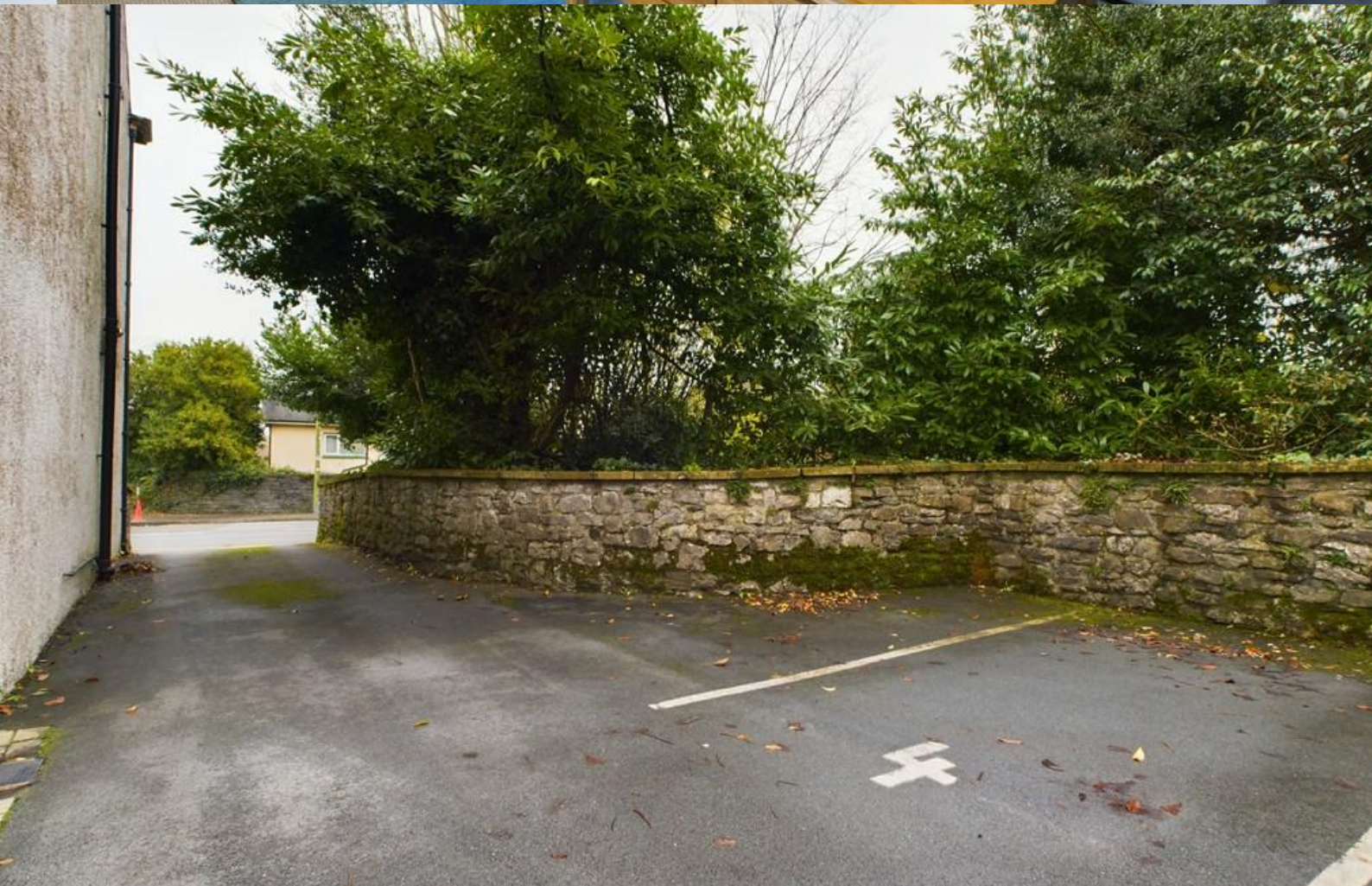
One Allocated Parking Space