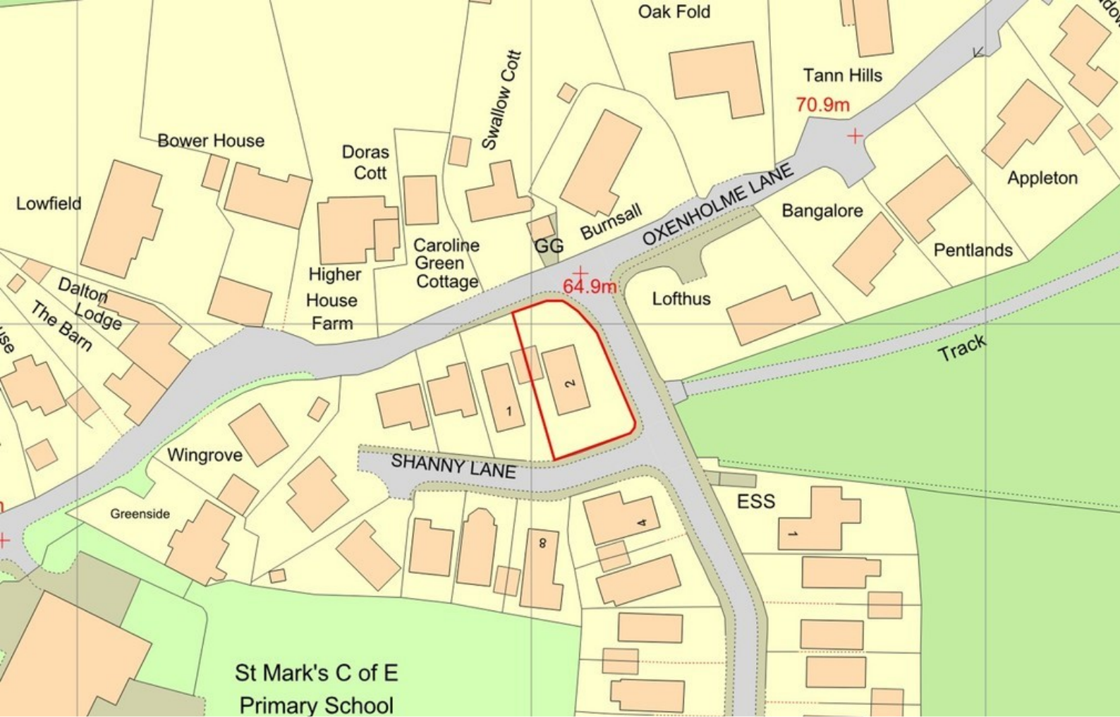
OS Map - 01193261