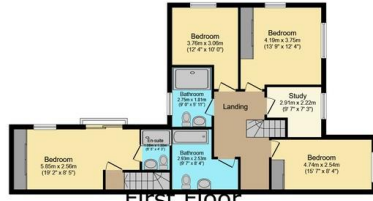
FIRST FLOOR Floor area 99.2 m 2 (1,068 sq.ft.)