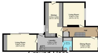
Ground Floor Floor area 87.4 m 2 (941 sq.ft.)