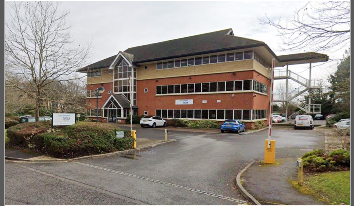
Existing External Building – Prior to Refurbishment