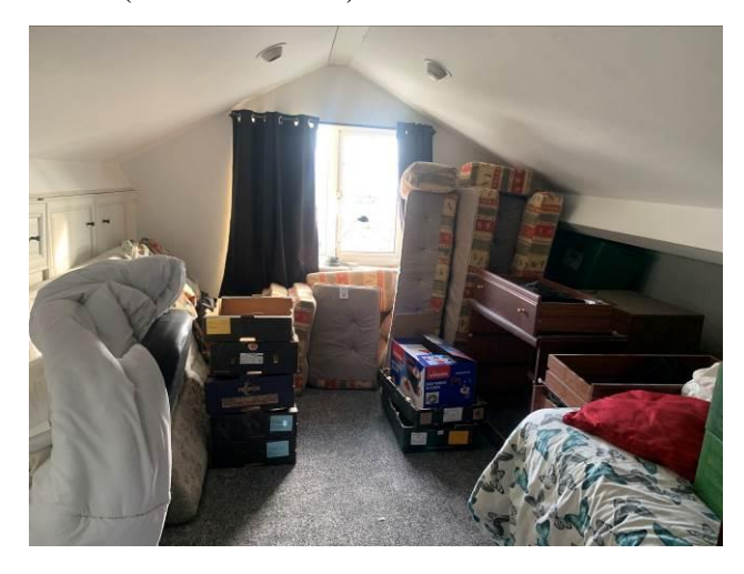
BEDROOM 4: 11' 9" x 9' 4" (3.58m x 2.84m)

BEDROOM 3: 13' 8" x 9' 3" (4.17m x 2.82m)