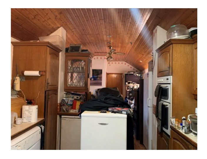
ADDITIONAL ROOM FOR POTENTIAL 10' 5 " x 10' (3.18m x 3.05m) This could be a utility/shower room/study

KITCHEN/BREAKFAST ROOM: 30' x 10' 5" (9.14m x 3.18m) This could make an amazing space for entertaining. Boiler concealed behind wood panelling.