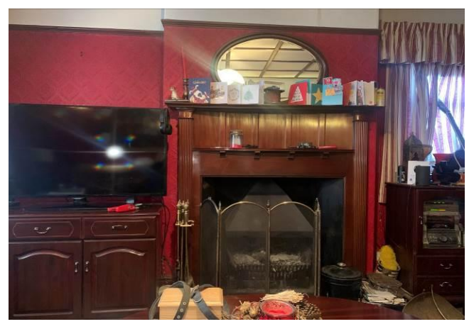
DINING ROOM: 13' 8" x 12' (4.17m x 3.66m) Open fireplace and patio doors.