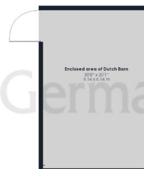
Ground Floor Building 3