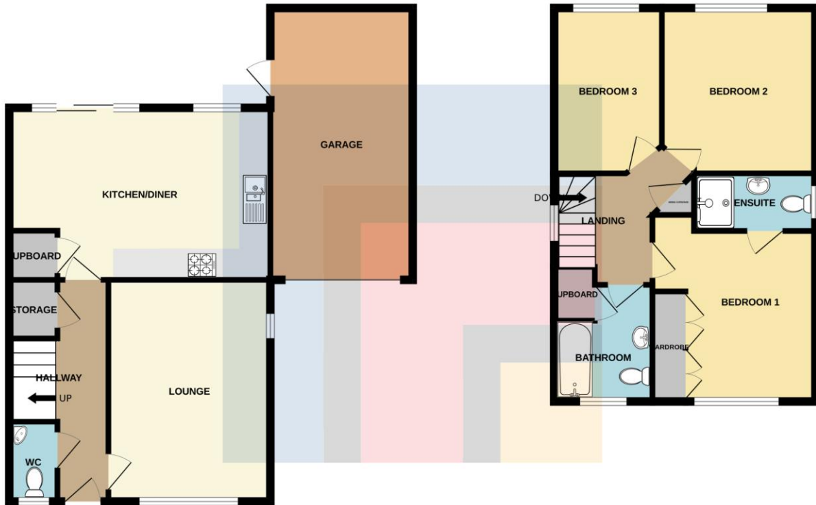
TOTAL FLOOR AREA: 1212 sq.ft. (112.6 sq.m.) approx.

Whilst every attempt has been made to ensure the accuracy of the floorplan contained here, measurements of doors, windows, rooms and any other items are approximate and no responsibility is taken for any error, omission or mis-statement. This plan is for illustrative purposes only and should be used as such by any prospective purchaser. The services, systems and appliances shown have not been tested and no guarantee as to their operability or efficiency can be given. Made with Metropix ©2024