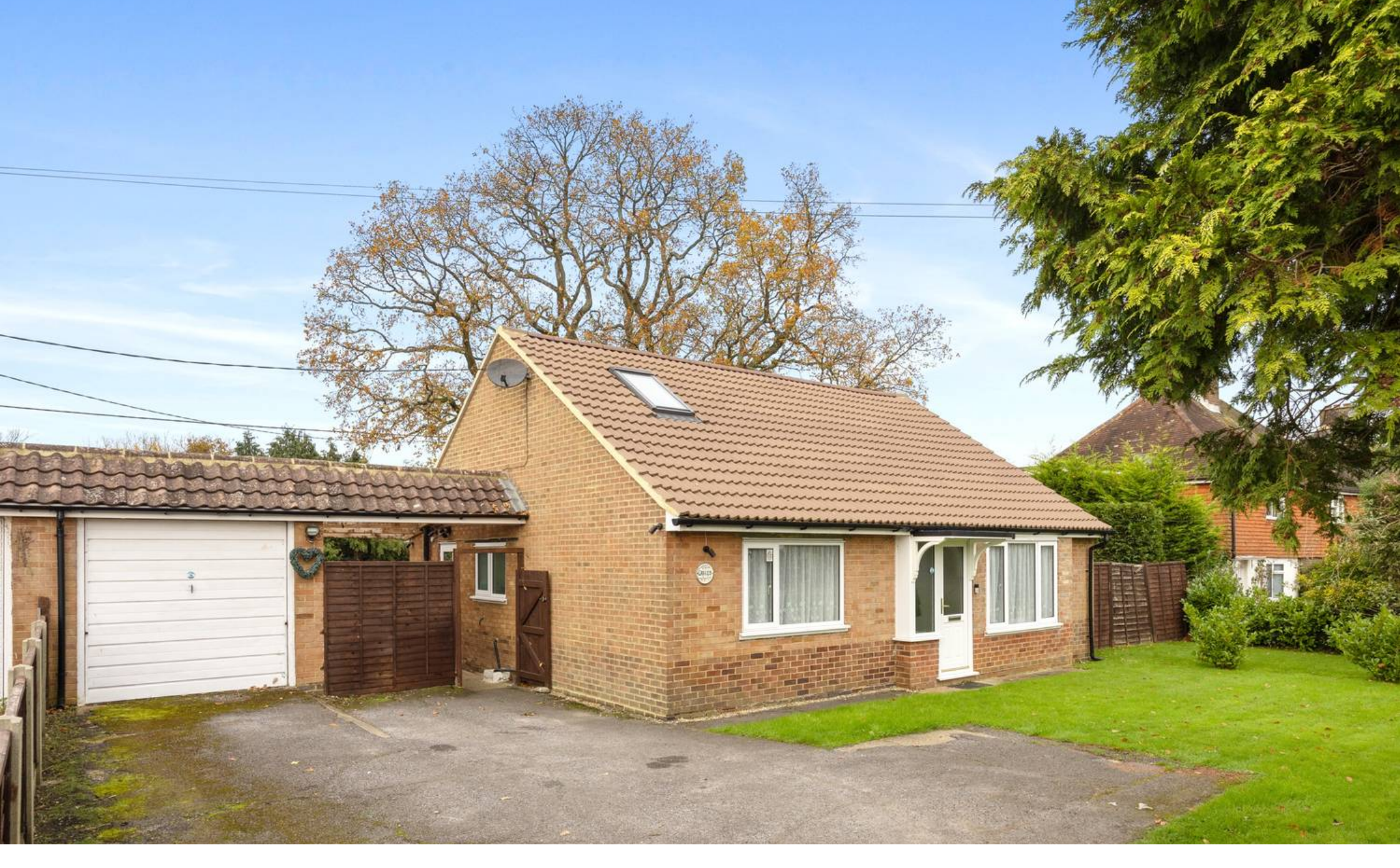
The Gables Dorking Road, Kingsfold Guide Price £500,000