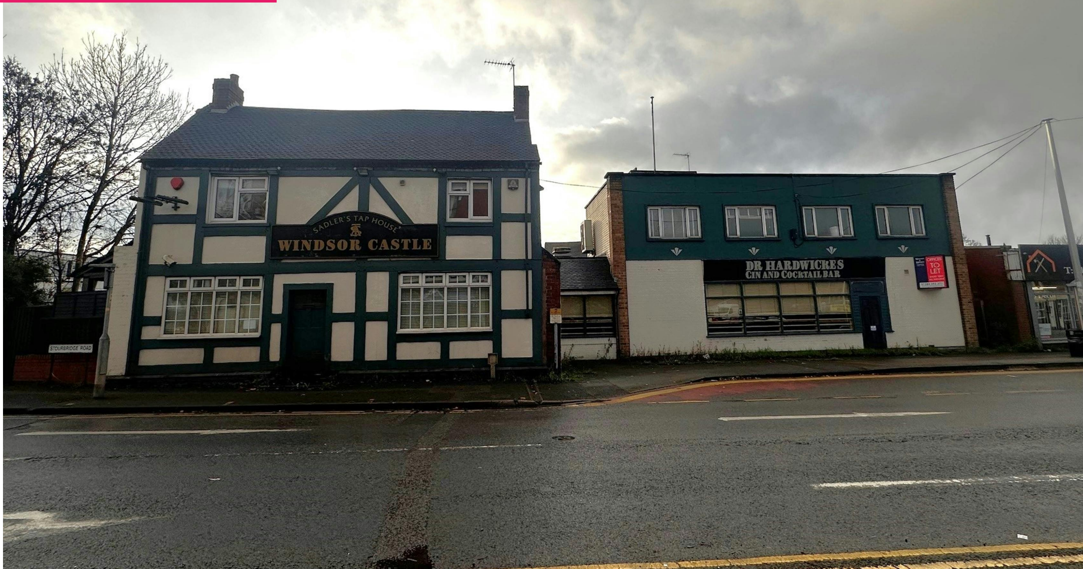
THE WINDSOR CASTLE, STOURBRIDGE, WEST MIDLANDS, DY9 7DG 7,200 SQ FT (668.90 SQ M)

SIDDALL JONES COMMERCIAL PROPERTY CONSULTANCY