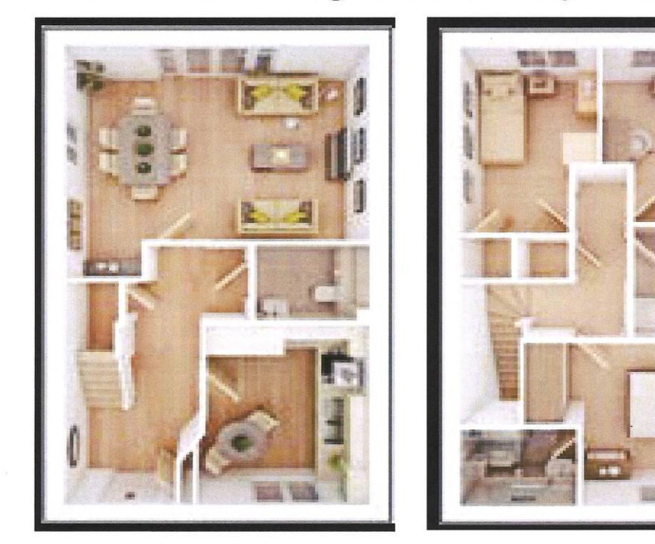
Kitchen 3.43m × 2.57m 11'3" × 8'5" Master Bedroom 3.71m × 3.11m 12'2" × 10'3" Bedroom 3 3.35m × 2.44m max 11'0" × 8'0" max

'THE BENFORD A' Design .... TOTAL 83.9 sq. m. / 904 sq. ft.