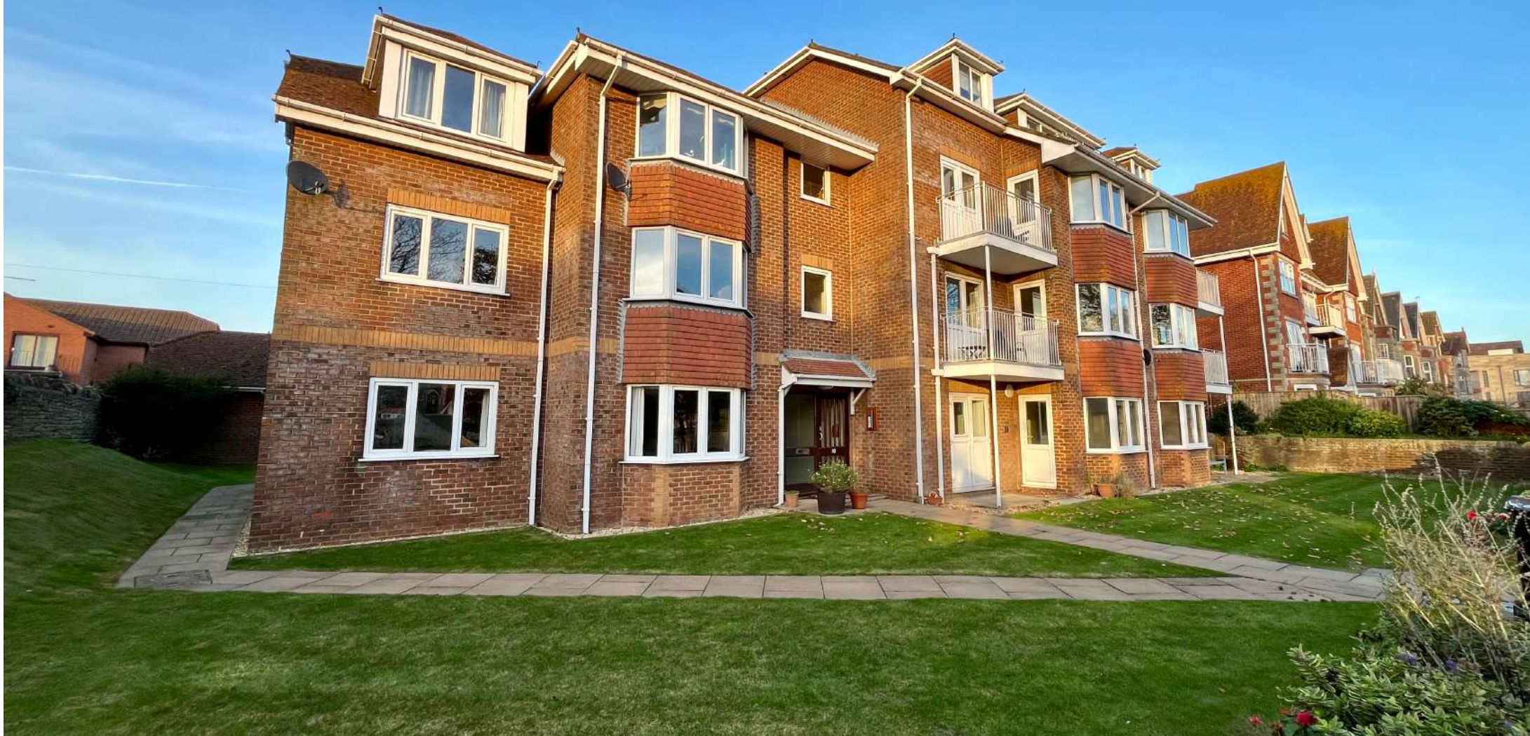
FLAT 2 SEFTON COURT, 10 GILBERT ROAD, SWANAGE £305,000 Shared Freehold