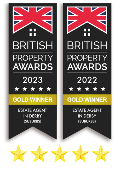
200+ 5 star Google Reviews

There are two Primary Schools, Hilton Spencer Academy and The Mease Spencer Academy which both feed through to John Port School in the neighbouring village of Etwall.