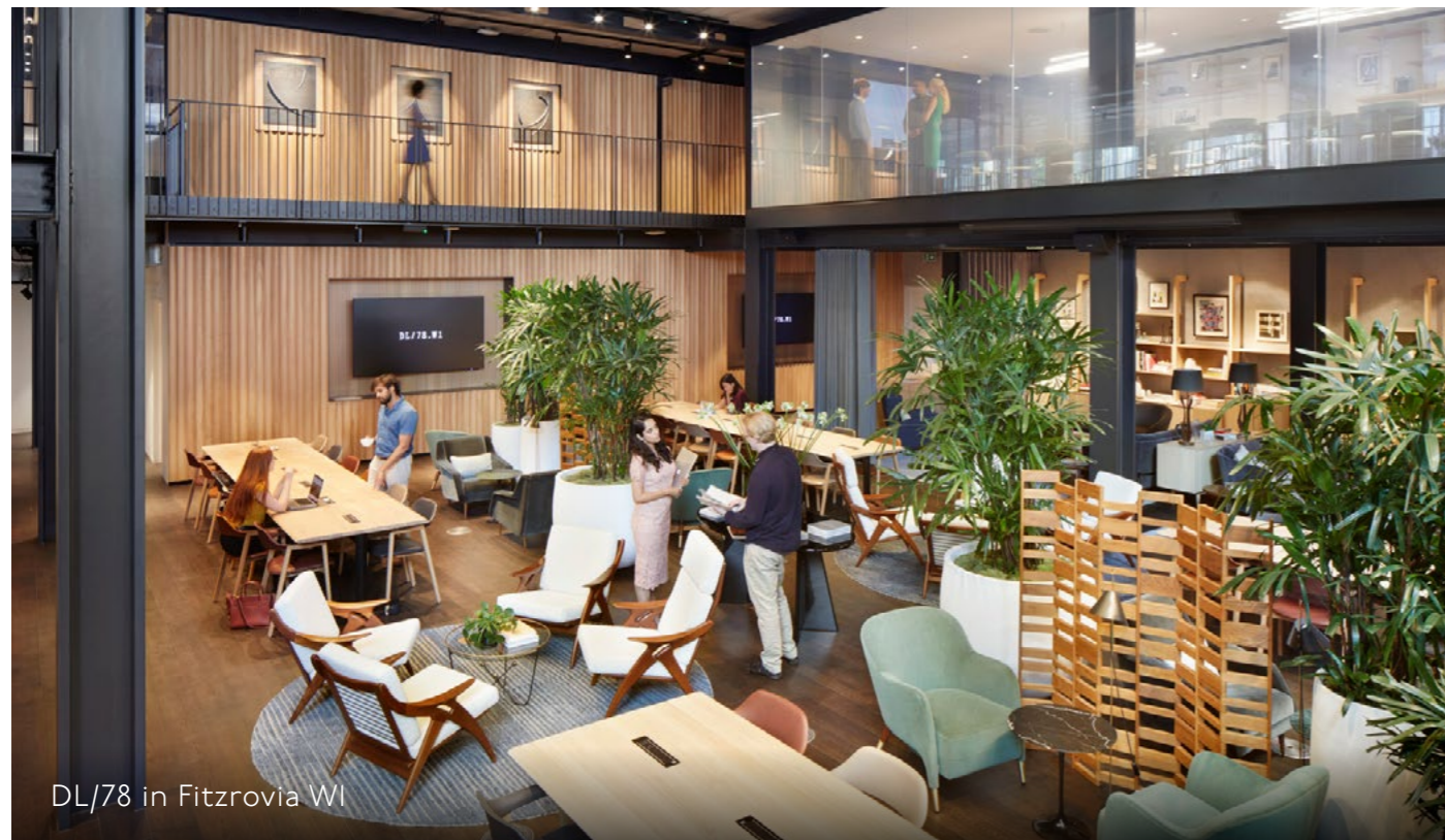
DL/78 in Fitzrovia W1