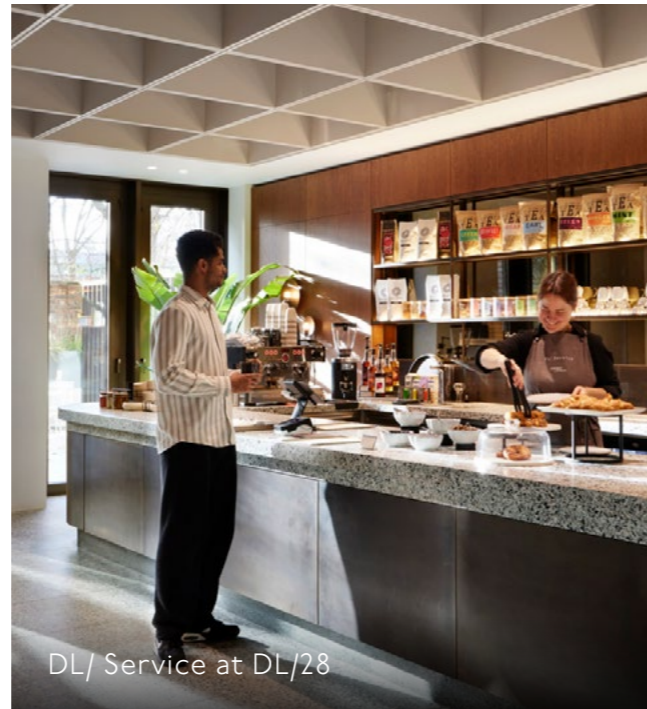
DL/ Service at DL/28

Members also have access to a packed calendar of experience-led events curated by our dedicated team. And the DL/ App is your effortless personal portal to all of it.