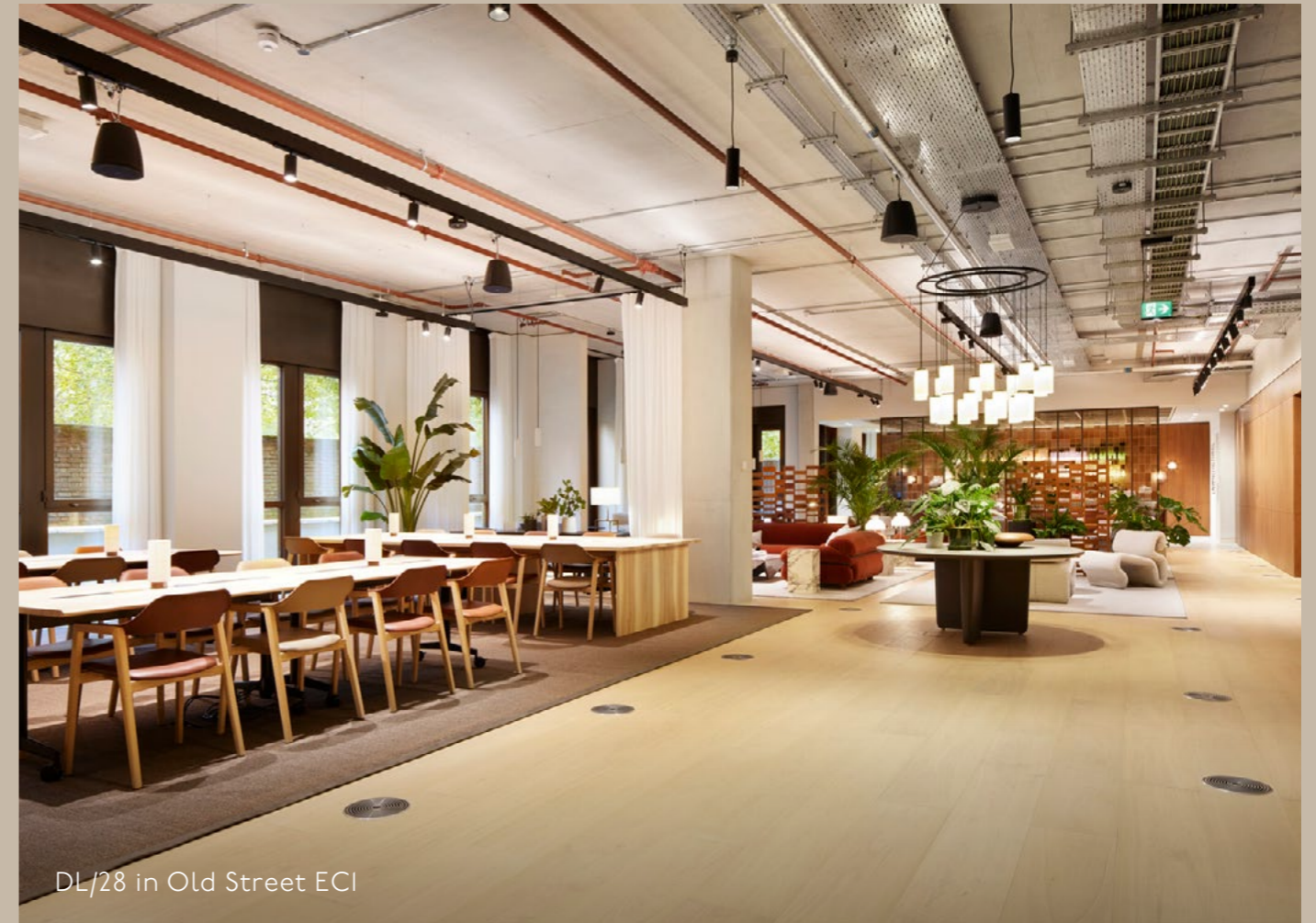
DL/28 in Old Street ECI