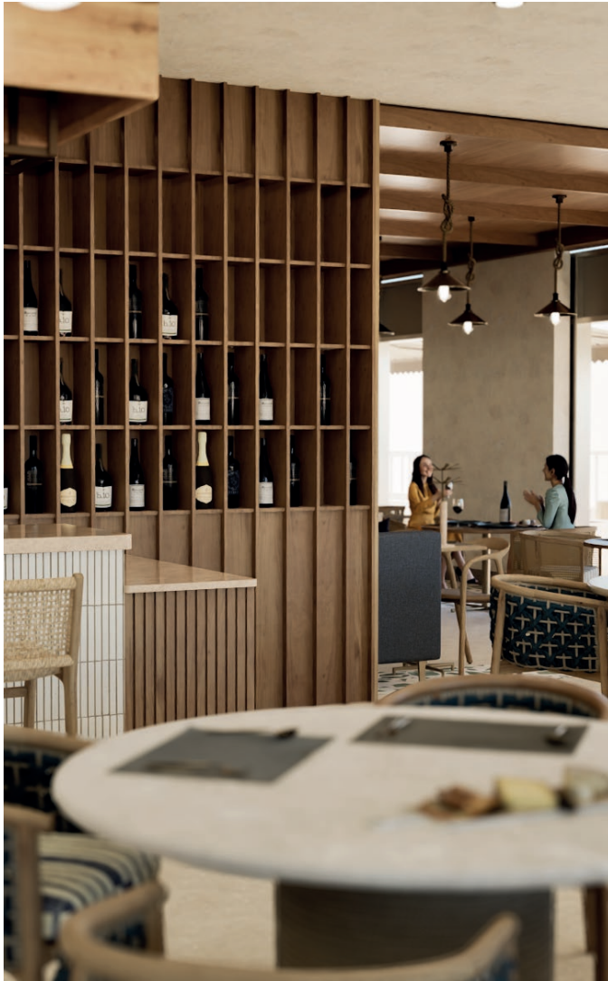
CGI for illustrative purposes