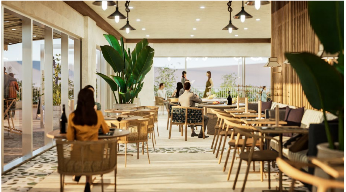
CGI for illustrative purposes