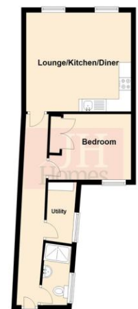
Total area: approx. 40.2 sq. metres (432.4 sq. feet)