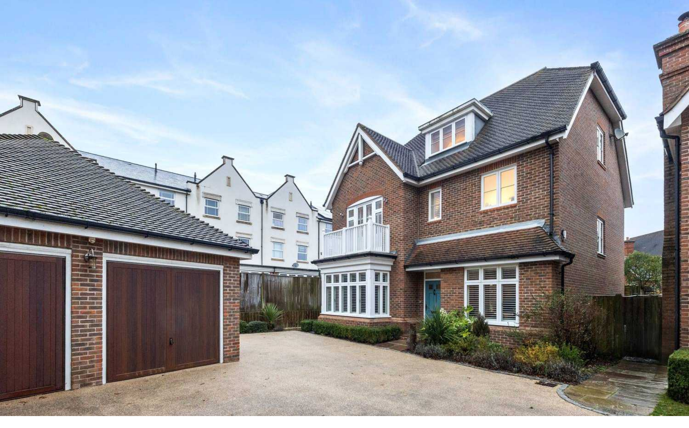
7 River Walk, Horsham Guide Price £1,150,000