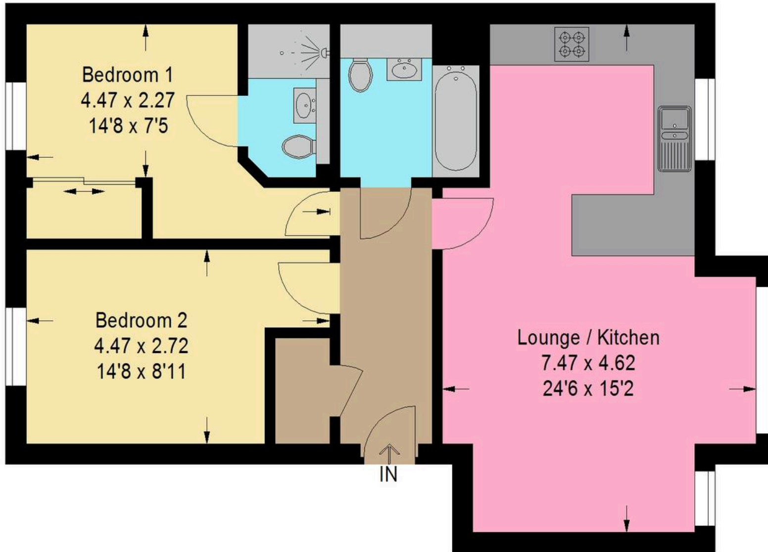
Illustration For Identification Purposes Only. Not To Scale (ID:1148576 / Ref:89638)

Approximate Gross Internal Area = 66.9 sq m / 720 sq ft