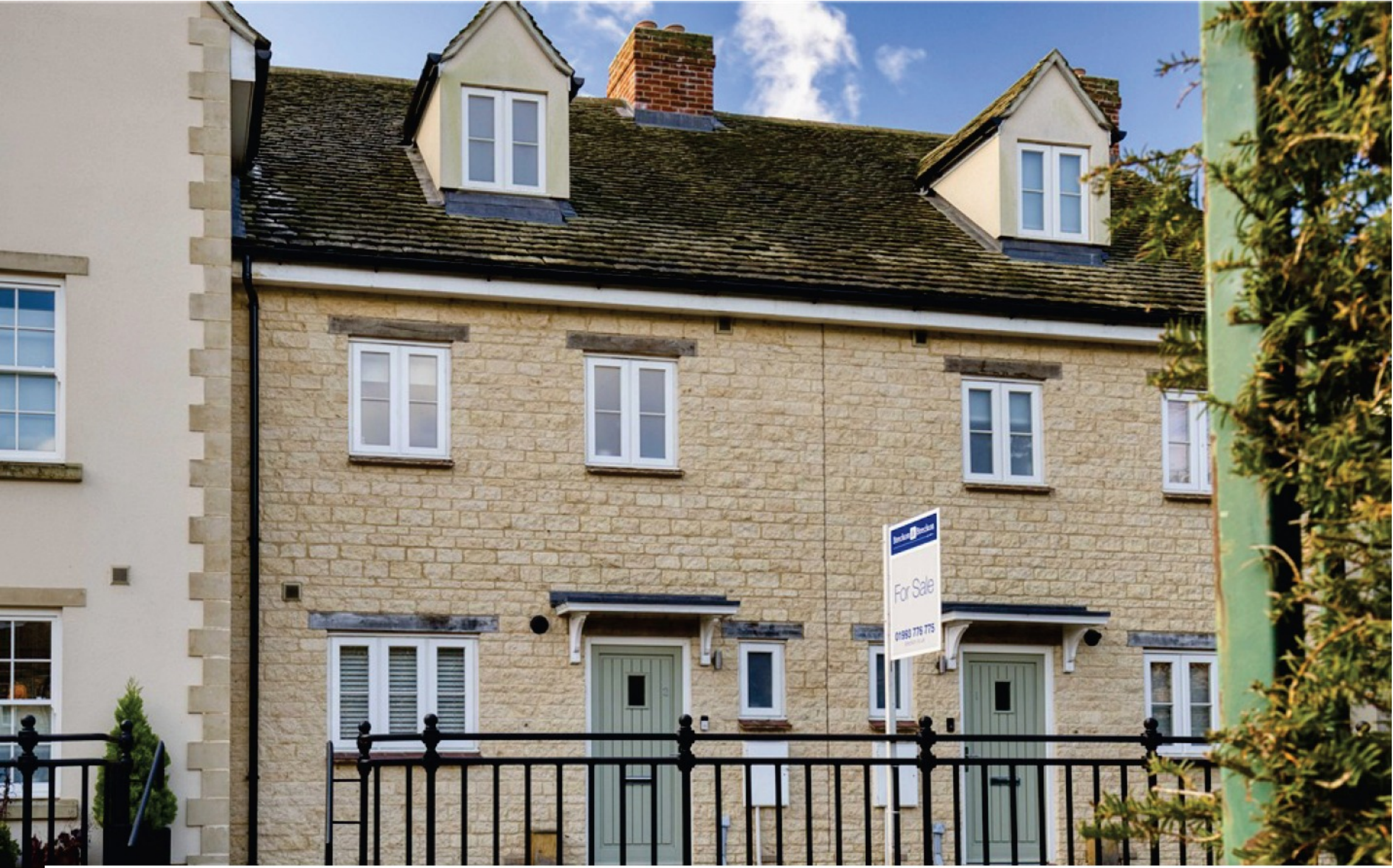
Wyatt Mews, Witney