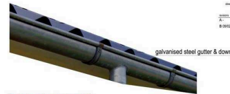
galvanised steel gutter & downpipe