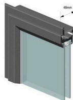
aluminium slimline casement window & glazed door section