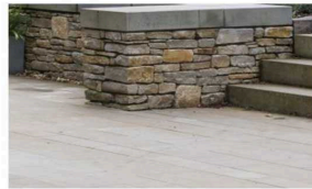
sawn sandstone paving (entrance thresholds)