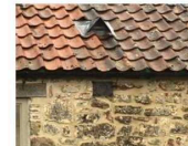
lead vent tile (in clay Pantl)