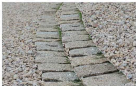
granite setts (edgings)