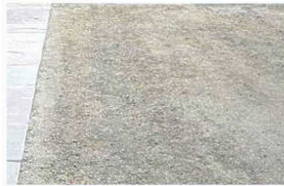
bound gravel (perimeter paths)